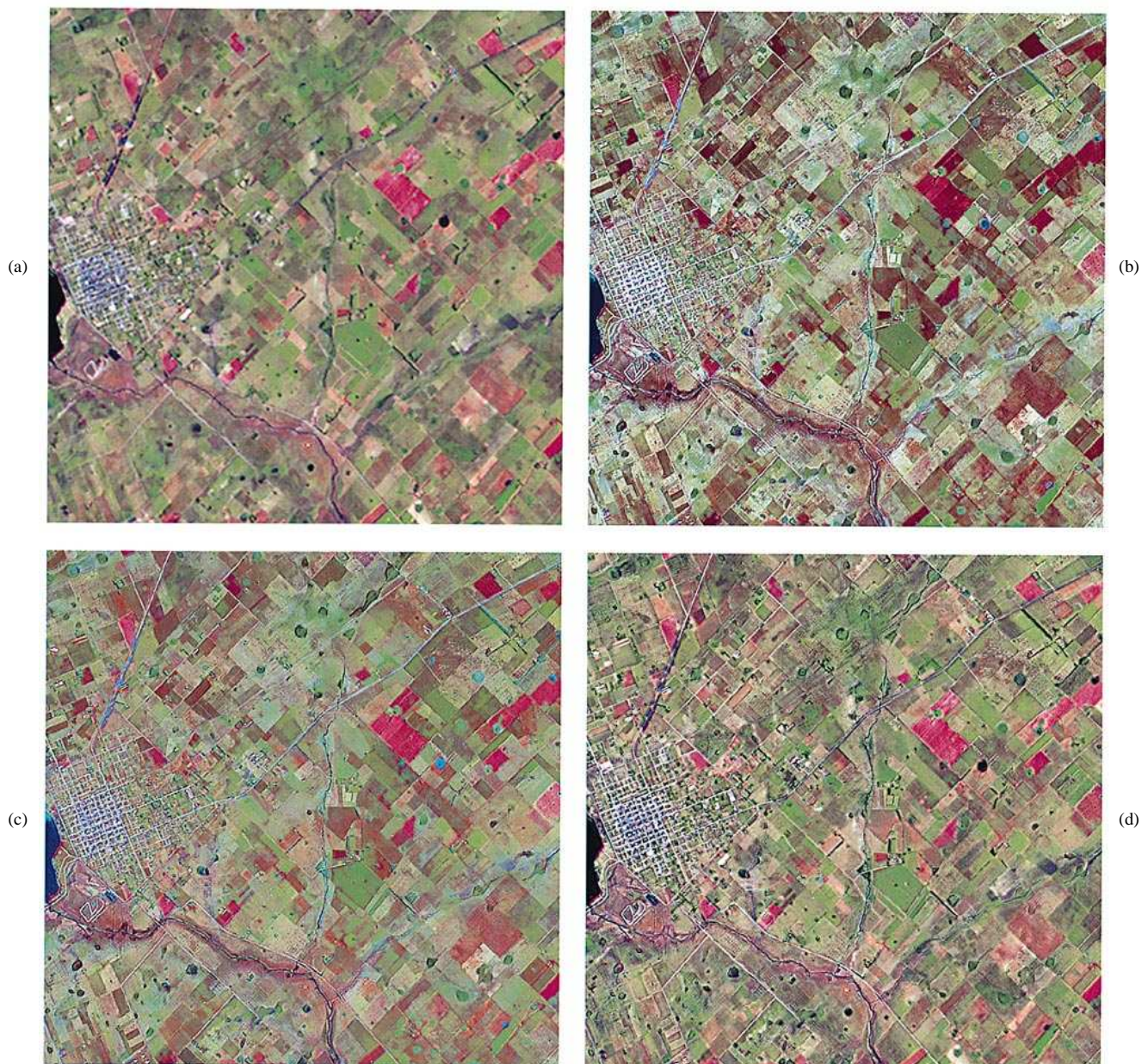
Fig. 2. (a) Detail of the LANDSAT (TM) image. (b) Result of the fusion by the standard IHS method. (c) Result of the fusion by the standard LHS method. (d) Result of the fusion by the additive wavelets on L component (AWL) method.

and rivers. The images were registered and the SPOT image was photometrically corrected to present a histogram similar to the L component of the LANDSAT image. Then, we applied the AWL image fusion technique and compared the results to those given by the standard methods.